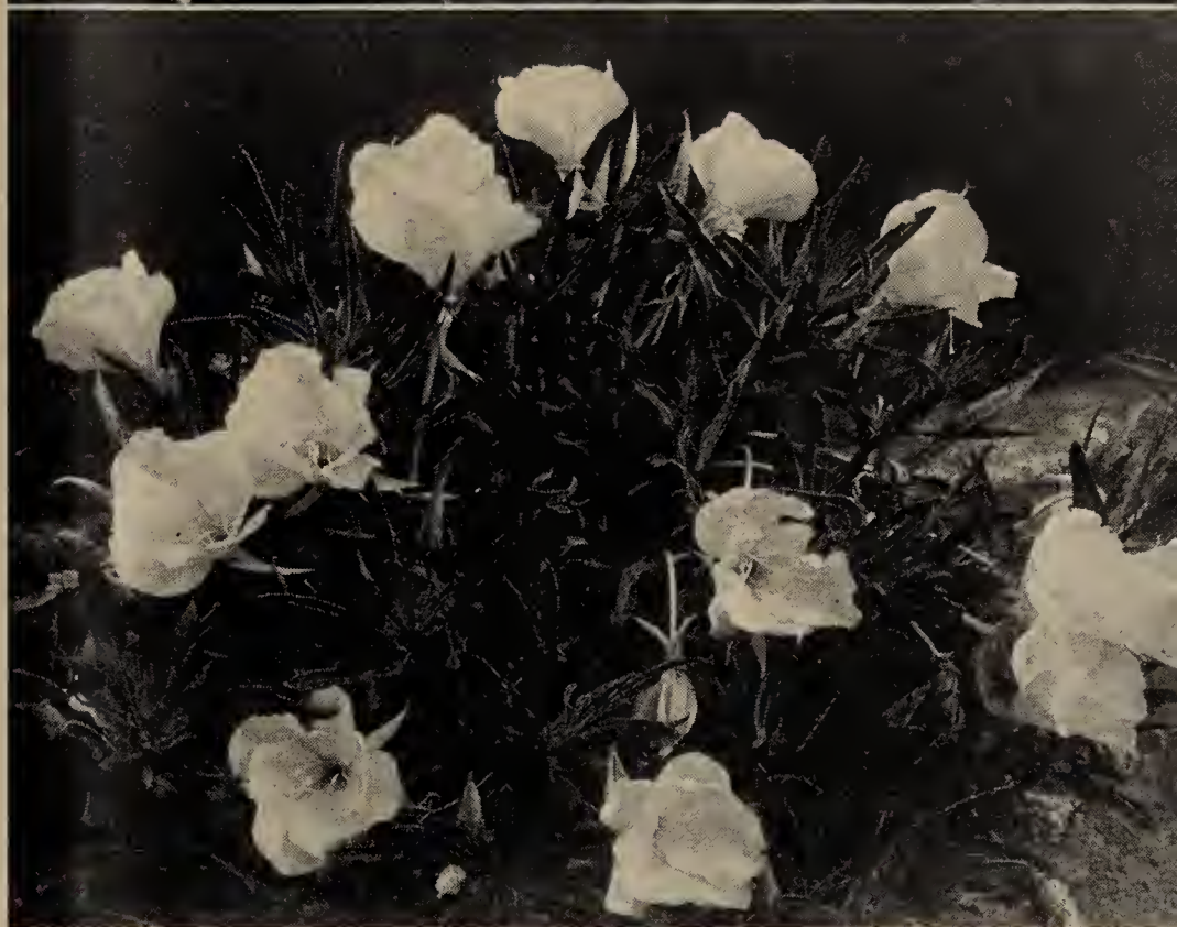
Saxifraga Decipiens Oenothera Missouriensis